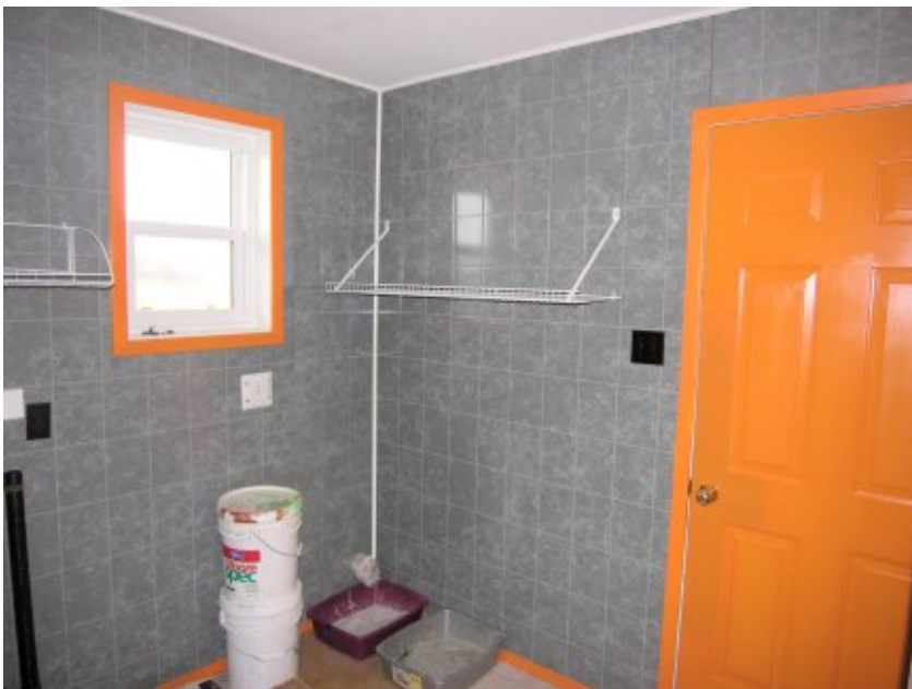
Main Floor Laundry Room