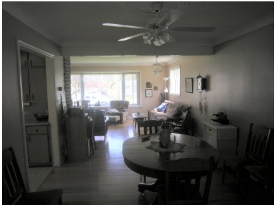
From Dining Rm Patio Door