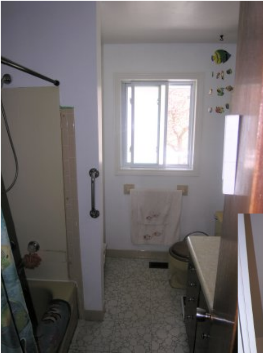
Main Floor 4 pc