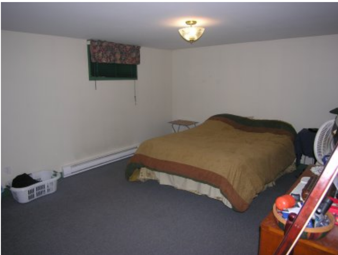
Bedroom Lower Level