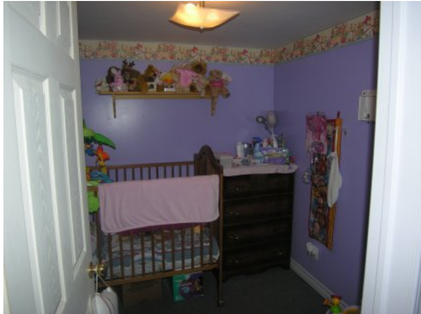
Den or Storage Rm