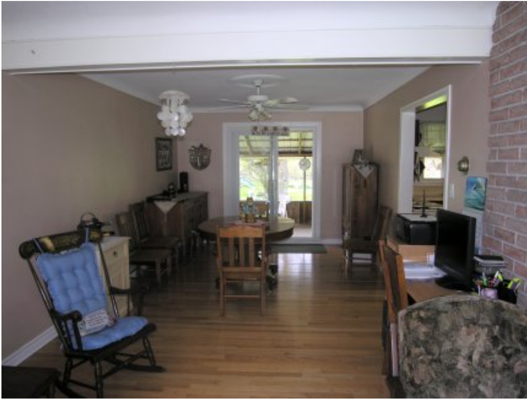
From Living Room