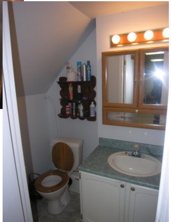
Lower Level 2 pc