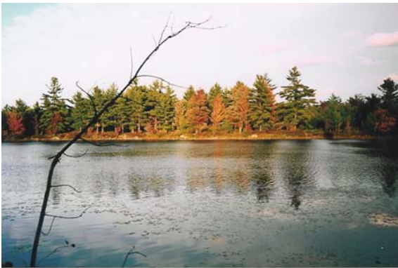
Lacey Lake Fall 2002