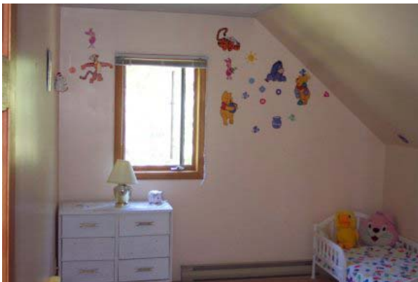
Upper Two Bedrooms