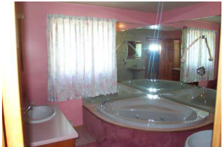
5 pc Ensuite