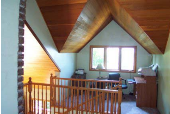
Upper Hall Den Area