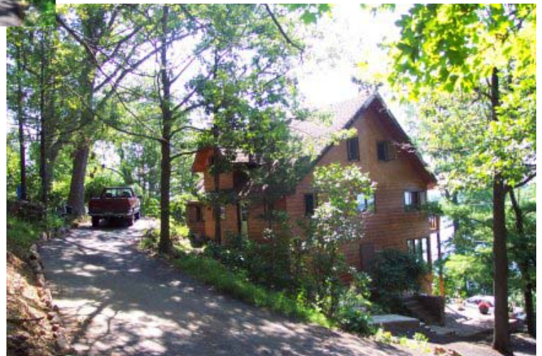
Rear West End