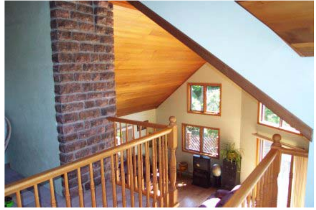
View From Upper Hall