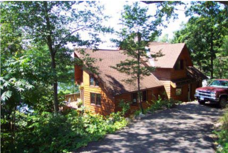
Rear East End